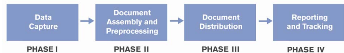
Figure 2: RightFax incorporates a four-phase process that captures any form of information, renders it into an electronic image, distributes the information via fax, email or over the Internet and creates customized reporting, including host notifications.