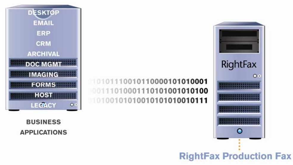
Figure 1: Each application outputs various forms of "information." Flexible RightFax integration tools can capture and receive this information seamlessly.

Once information is sent from an application(s) to RightFax, a four-phase process begins.