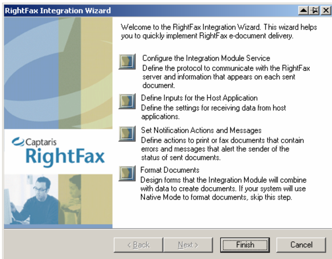
Figure 1. The RightFax Integration Wizard makes building integrations faster and more efficient.

RightFax production fax and electronic document delivery solutions offer an Integration Wizard that streamlines integration with back-office applications.