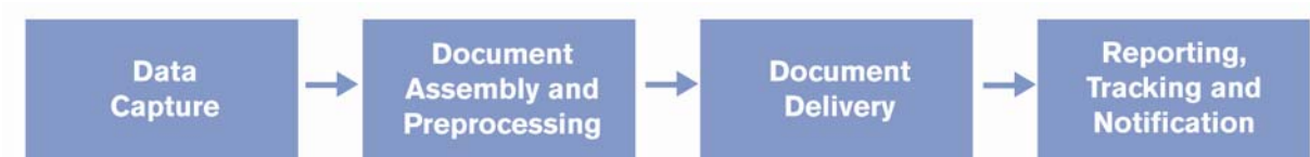
Figure 3: RightFax incorporates a four-phase process that captures any form of information, renders it into an electronic image, distributes the information via fax, email or over the Internet and creates customized reporting, including host notifications.