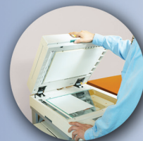
End User Adoption Rate